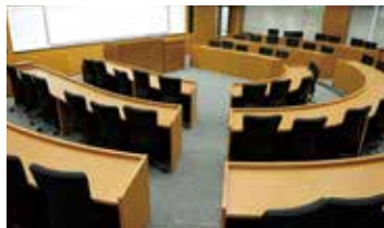
Class Room 101 Capacity: 60 seats. Multimedia compatible.