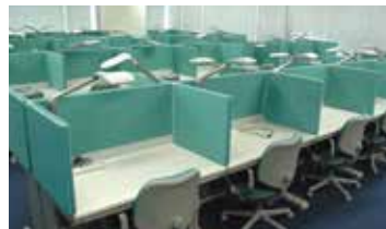
Study Room Capacity: 95 seats. Study booth and locker for every student.