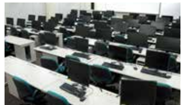
Computer Room Capacity: 30 seats. Mainly used for Information technology lectures.