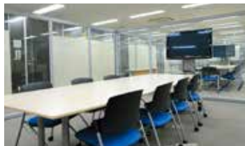
Lab Square Small conference space.